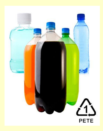
1, 2, 3, 5 household plastics are to be placed together into 1 blue box