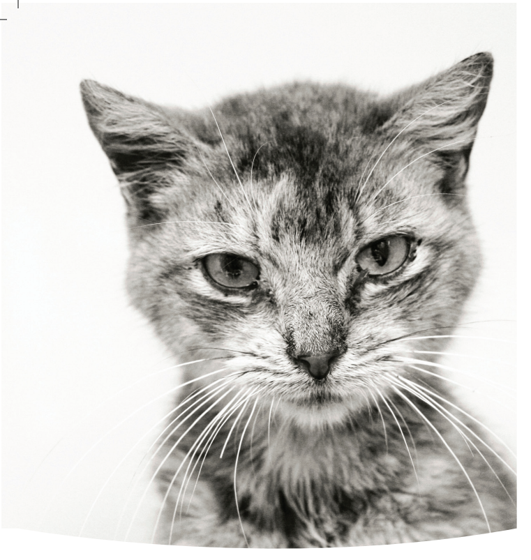
Buster Collingwood, ON